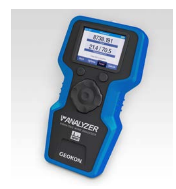
GEOKON Model GK-406 Readout for use with the Model 4000 and 4050 Strain Gauges.